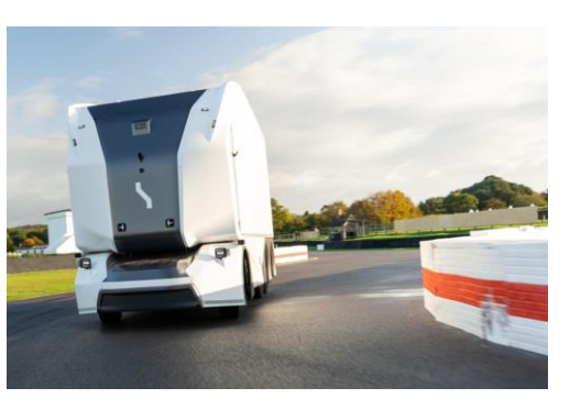
Freight Mobility Platform