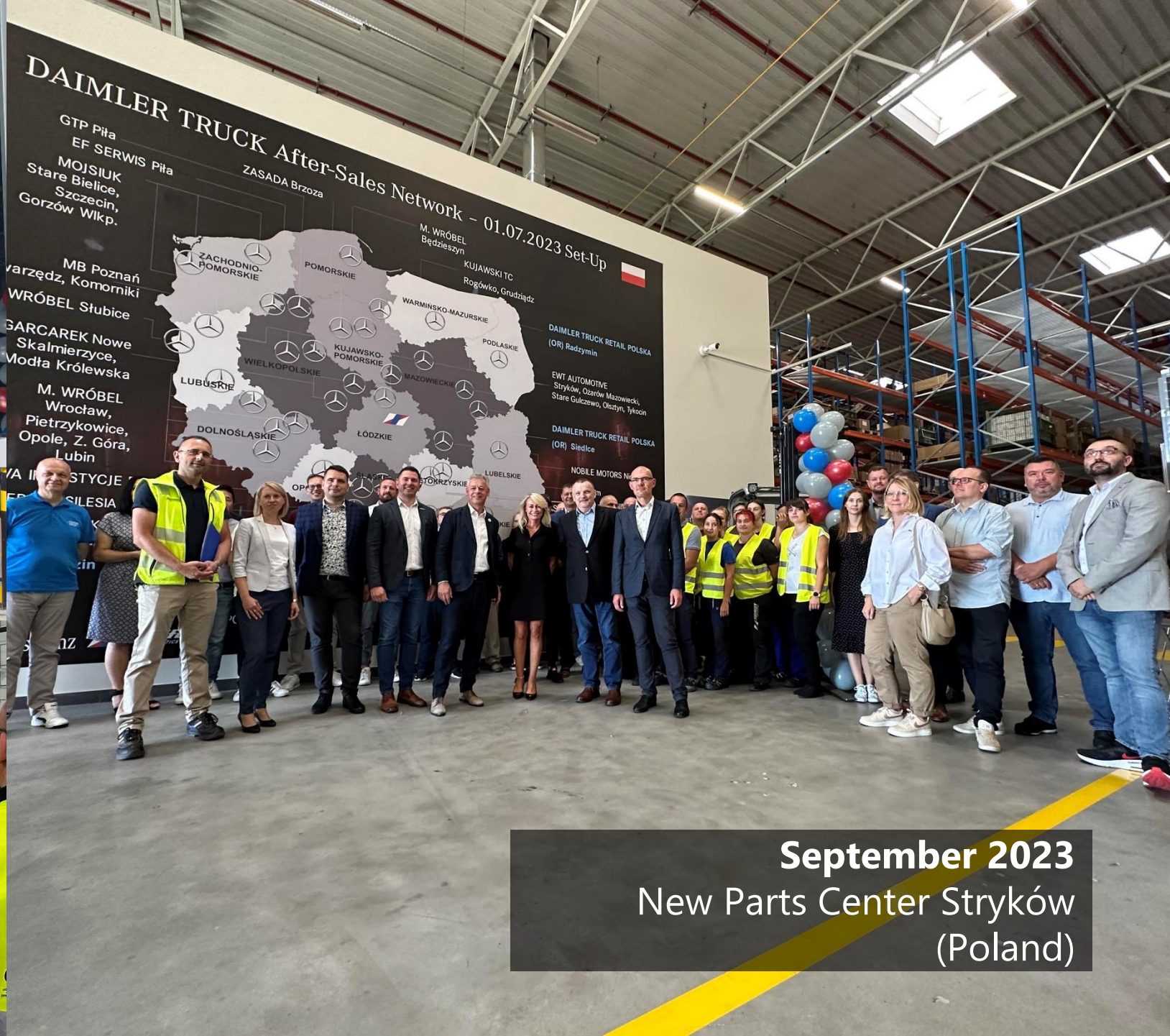
September 2023 New Parts Center Stryków (Poland)