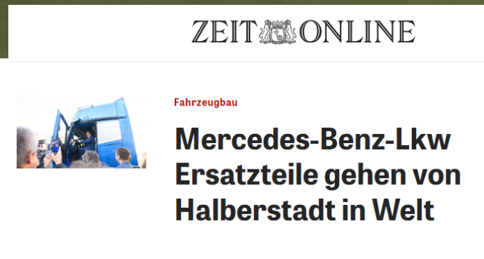
ZEIT ONLINE, 13.01.2023